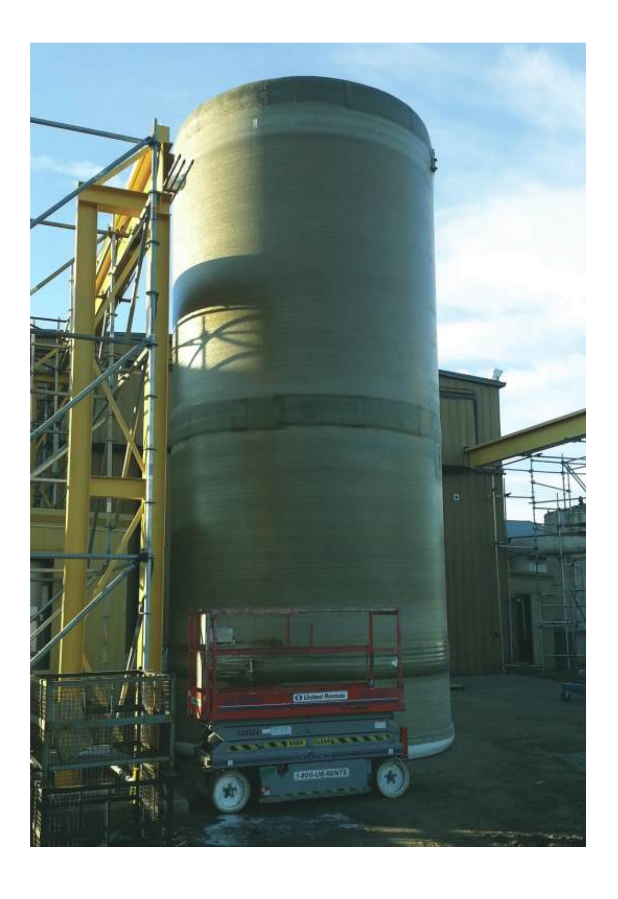
Compress Pressure Vessel Design Software Free 14